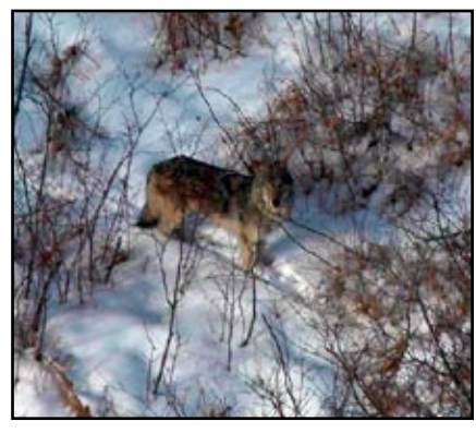
Two packs of wolves are thriving on Camp Ripley, coexisting with troops in training.

have negatively impacted training in the absence of sound research, the team has provided scientific evidence that the gray wolf population has greatly benefited from military land use practices.