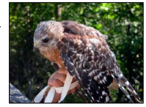
Camp Ripley maintains the largest breeding population of red-shouldered hawks in the state.

state-listed species of special concern. Red-shouldered hawk populations are projected to decline under all timber harvesting scenarios for Minnesota for the next 50